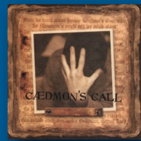
This World by Caedmon's Call from their self-titled debut album